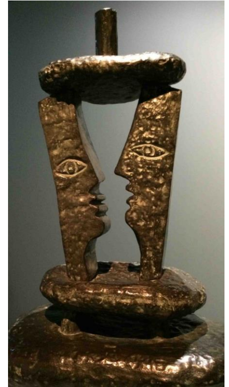
G. Braque: Hymen