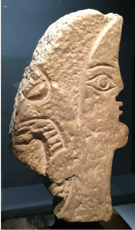
G. Braque: Hespéris