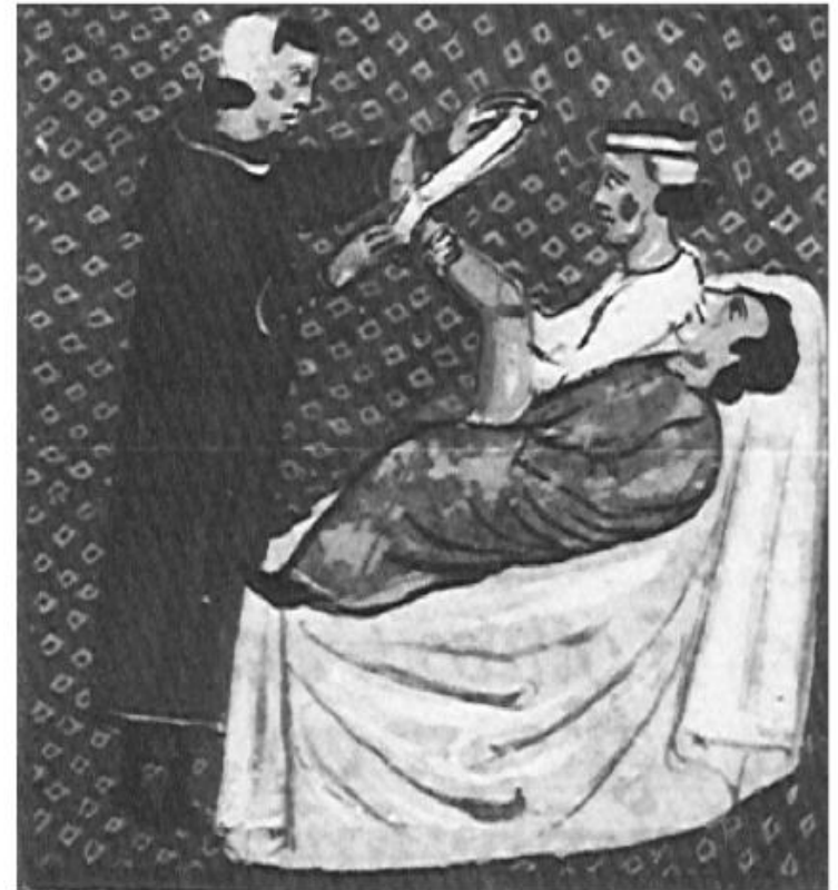
Theodoric Borgognone Cyrurgia (fin XIIIe)